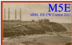
Cover of my fold out QSL card