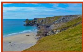
The coast at Poldhu today