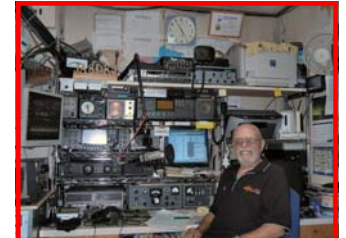
K1KU operates JA8DKJ