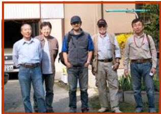
JA8LWU, JA8UUM, JJ8KGZ, K1KU, JA8KDJ