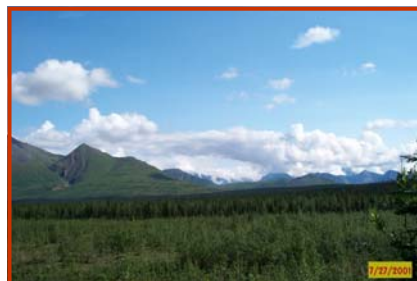
A view of the Alaska Range from the porch of Bob's bush camp

There you have it, whatever "it" is. Maybe you'll be motivated to do some operating where you can add a /P to your call. If you've never done it, you'll just have to take my word for it, and that word is, IT'S FUN!"