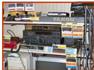
JA8EFI's Ham store