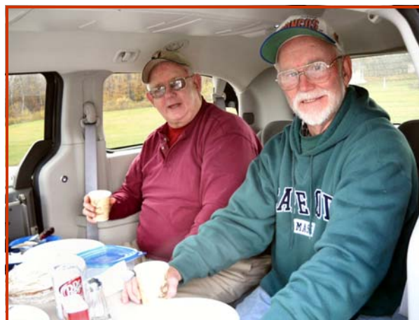
WK1L & N1YPS dine in the comfort Of AA1XU's van