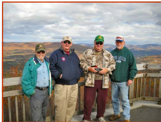
K1KU, WK1L, AA1XU, N1YPS

Would we do it again? Can you hear the echo of that resounding YES? We're definitely going to need a shakedown session or two in preparation for Field Day 2011. If you'd like to be included in those plans give me a shout. I'll add you to the list of fun seekers.