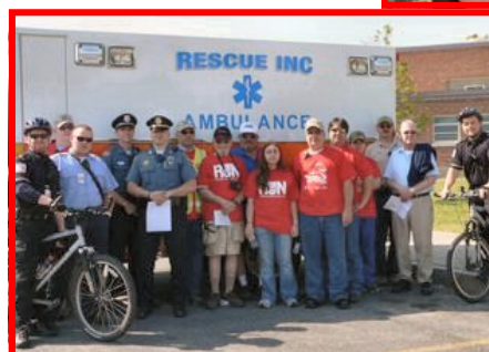
The Whole GOTR Emergency Team