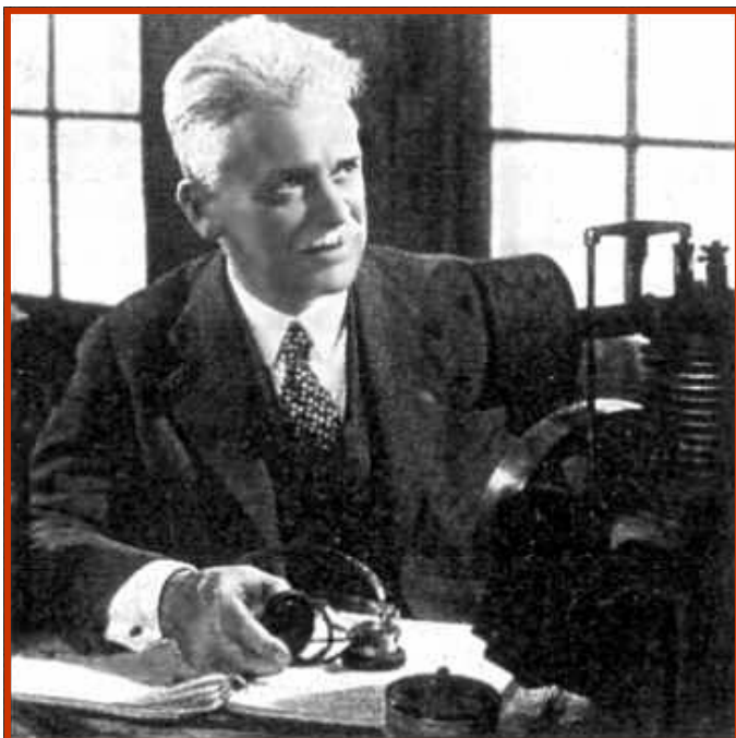
Hiram Percy Maxim