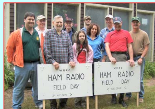
The 2007 Set Up Team

The set up work went by quickly due to the able assistance of the largest crew we've ever had. It was great to see two members