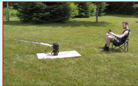
KB1NWU, Nathan Looking for the birds