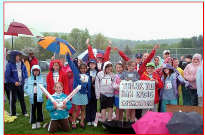
Girls on the Run say THANKS!

In the true spirit of Boy Scouting and Ham Radio, though, the twelve communicators from